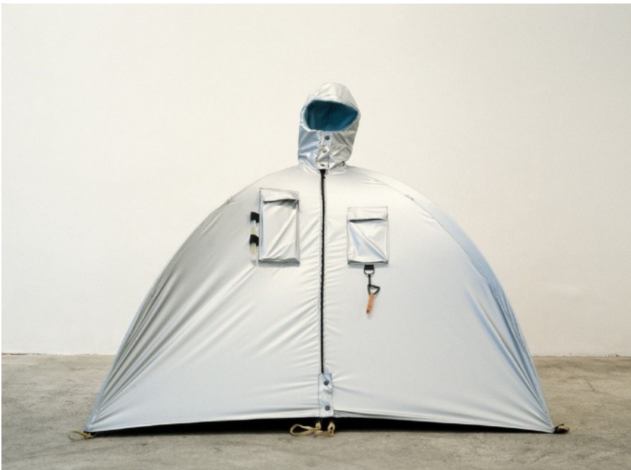
Above: Refuge Wear, Lucy Orta 1992-1993

What do you think this is an image of? What does it make you think of?